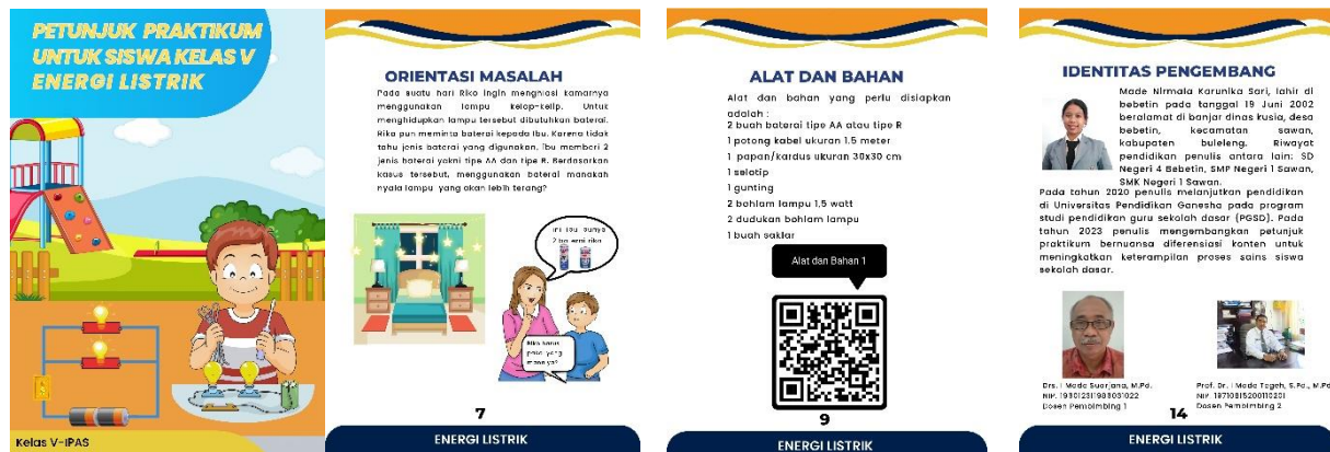
Figure 1. Design Results of Practical Instructions

can be used for a long time. The size of the practical instructions is A5 so that students can easily carry them. The practicum instructions contain electrical energy material. The practicum carried out is making a simple electrical circuit. The results of the design of practicum instructions with nuanced content differentiation can be seen in Figure 1.