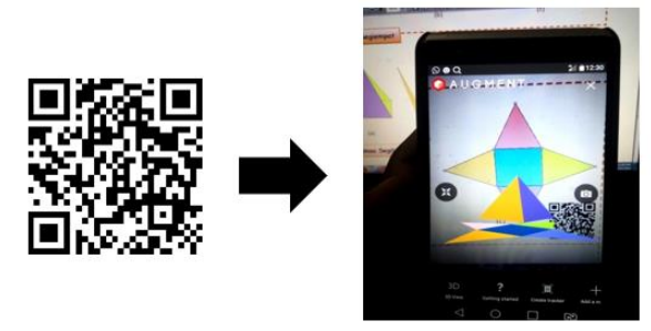
Figure 1. The marker (QR code) is scanned by using an Augment application.

The current study used learning materials developed by Auliya & Munasiah (2019), regarding learning geometry 3D using AR technology based on marker. The geometrical objects in course materials were designed by Sketchup, and Augment for Sketchup plugin turns the uploading models into QR code (as a tracker). Then, the students could use their mobile phone to view 3D objects which were coming out from the pages, and the virtual objects can be seen from different angles in a 3-dimensional way. Previously, students have to install an 'Augment' application that can be download for free on smartphones. The example of learning materials could be seen in Figures 1 and 2.