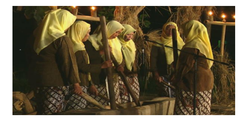
Figure 2. Nutu movement on Gejog Lesung

The android (Gejog Lesung) is one part of many physical arts types that contain many educational values, local wisdom, and are very relevant to life today, especially the values contained in the opening of the 1945 constitution and Pancasila. Educational values contained in the mortar gejog include, religious values, ethical values and politeness, responsibility, mutual cooperation, nationalism, national unity and unity, values of social justice and deliberation, and personality. The aforementioned core values are in line with Ki Hajar Dewantara's thoughts which state that physical arts, like the (gejog lesung) are not only as sports media, but also as a media of education. Values Interpretation of the gejog lesung various movement meaning becomes one of the ways to understand the moral and character education values contained in the (gejog lesung). The intended educational value aims to help humans to be able to understand, realize, internalize, and practice the values of goodness so that they can place them well in everyday life. Educational values contained in the (gejog lesung) that are relevant to the values contained in the opening of 1945 constitution to be understood and studied include: Religious values; this value can be pointed out in the variety of nutu movements performed during the performance. Following is the description of the nutu movement in Figure 2.