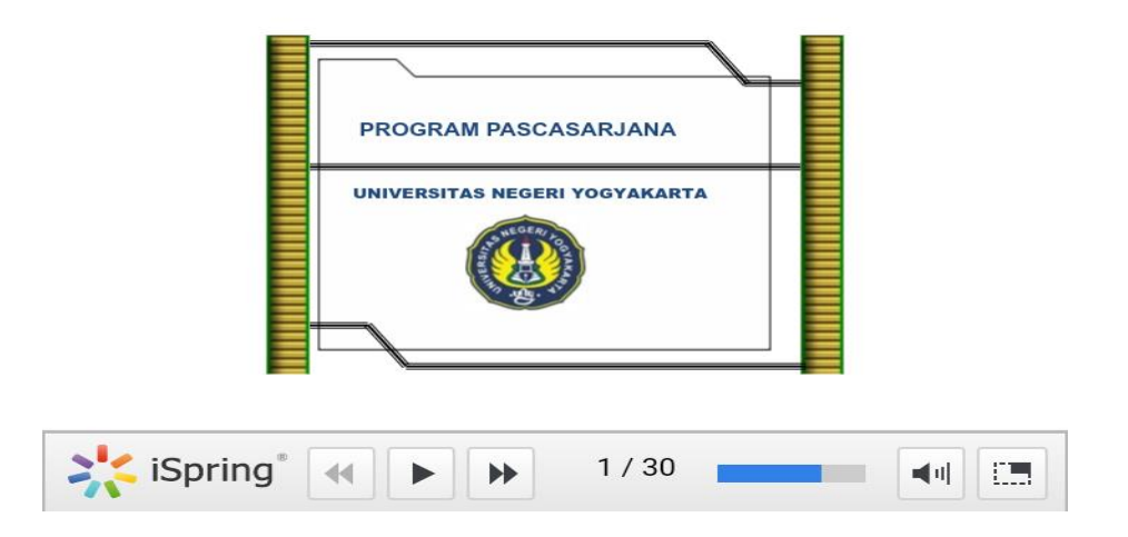
Figure 3. Android civic e-learning media

Pancasila values and the 1945 Constitution are relevant to the gejog lesung which focuses on various movements and can be used as a media for learning technology-based citizenship education in accordance with the industrial revolution 4.0. Android platform-based technology is a suitable media development option for students to develop in Yogyakarta. Gejog lesung based on e-learning media is applied to civic education learning about the implementation of the state government to train students' information literacy skills in accordance with the demands of the 21<sup>st</sup> century can be seen in Figure 3.