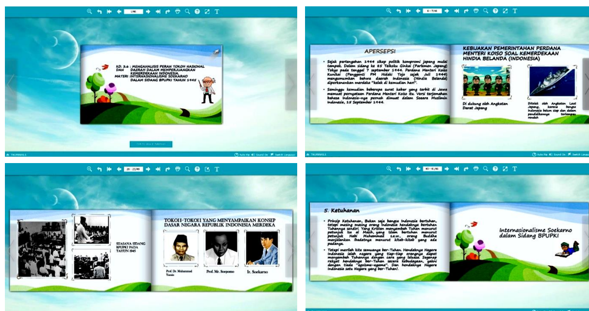
Figure 3. Design Revision and Final Results of Digital Flipbook Learning Media.

After the stages of developing digital flipbook learning media and revising and improving digital flipbook learning media, the next step is testing the implementation of digital flipbook learning media. This test is conducted to determine the effectiveness of the media to be applied to the effectiveness test of digital flipbook learning media. Experiment development on small group studies conducted the application of digital flipbook learning media to students with ten students as the objects who used digital flipbook learning media. The results achieved from these ten students as the objects revealed that they were interested and agreed to learn historical material using digital flipbook learning media. Then for a large group experiment conducted by the author, the application of digital flipbook learning media to 25 students as the objects revealed that they were also interested and agreed to learn historical material using digital flipbook learning media. Some reasons students are interested and agree to use digital flipbook learning media are, the delivery of historical material is equipped with interesting visual and audiovisual aspects with various color gradations, making it easier and interesting for students to understand and listen to historical material.