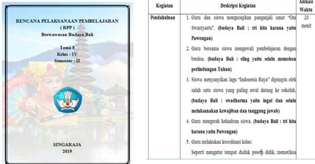
Figure 3. RPP

experts, instructional design experts, Balinese cultural experts, and evaluation and education experts.