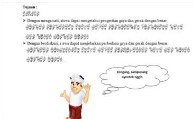
Figure 2. Display the contents of LKPD

The lesson plan consists of identity, learning objectives, basic competency, indicators, materials, approaches and methods, learning media and tools, learning resources, learning activities, and assessment. At the development phase the development of teaching materials carried out in accordance with the design. After teaching materials were developed, the validity of teaching materials were assessed using questionnaires to five experts, 2 science