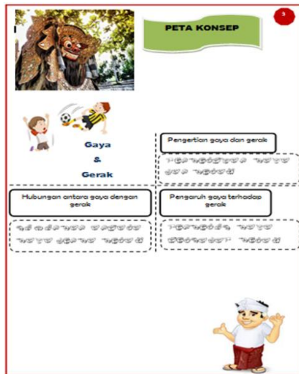
Figure 4. LKPD concept