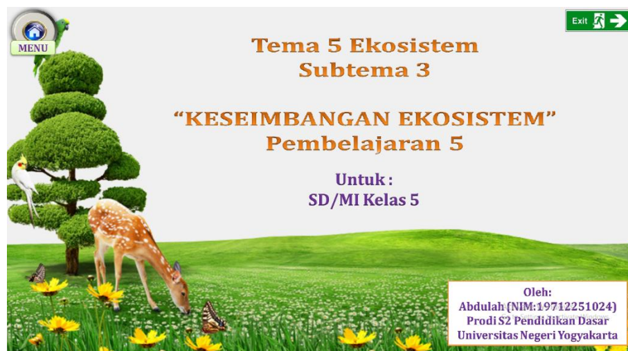
Figure 1. Main page of interactive Multimedia based on PBL

The product in the form of interactive multimedia based on problem based learning has been developed. The steps used by researchers to develop this interactive multimedia use adaptation of development research procedures by Borg & Gall. The following is the result of developing interactive multimedia products based on problem based learning.