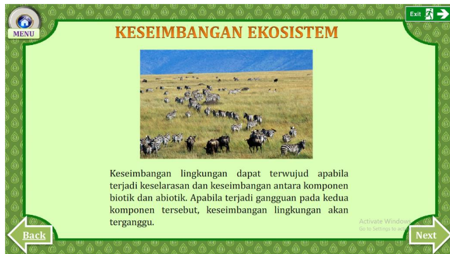
Figure 2. Display of material in interactive Multimedia based on PBL

Interactive multimedia based on problem based learning in this study used the Macromedia Flash 8 application. The material in interactive multimedia is prepared based on problem-based learning designs and it is adjusted to the competencies to be achieved in learning. It is related to ecosystem balance material in elementary school science subject matter. This material is material that includes the factors that cause the balance of the ecosystem and the efforts that can be made so that the balance of the ecosystem is maintained.