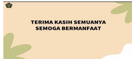
Figure 4. Closing Layout