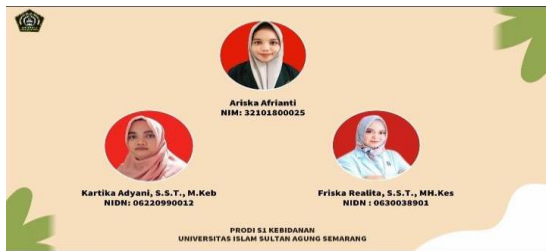
Figure 1. The Layout of Researcher and Supervisor Profiles