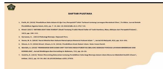
Figure 6. Bibliography Layout

The three stages of development, flowcharts, and storyboards were developed into sexual education videos using Filmora X software containing 30 frames consisting of the start page/main menu frame, profile frame, material frame, evaluation frame, and closing frame, with 12.34 minutes. The validation results from experts are presented in Table 2.