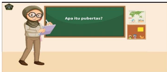
Figure 3. The Layout Of Sexual Education Materials