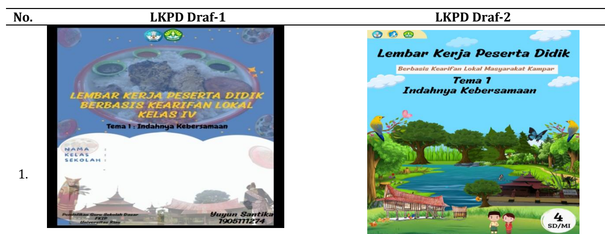
Table 3. Changes in LKPD for Social Studies Learning Based on Local Wisdom of the Kampar Community in Draft-1 and Draft-2

The cover of the first LKPD uses white and turquoise, based on expert assessments, the cover media is not yet attractive to elementary students, and the proportional layout of the images and titles is also not balanced.