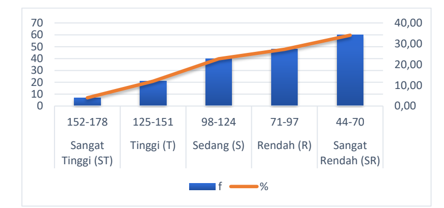
Figure 1. Results of Instrument Processing Addiction Online Game Students Experimental Group (n=176)

The study was carried out with a sample group of 176 students from classes X, XI and XII. An overview of the overall online gaming addiction of students can be seen in Figure 1.