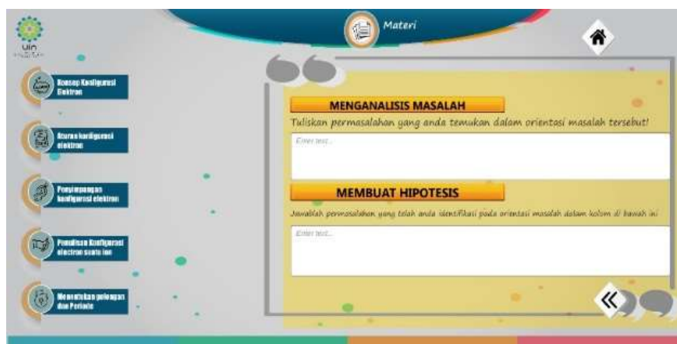
Figure 3. E-module display at analyze the problem stage

The second stage of the worksheet is analyzing the problem. At this stage, each group is required to analyze the problems that have been presented at the problem orientation stage. Students write the results of their problem analysis on a worksheet. The e-module display in the second stage can be seen in Figure 3 .