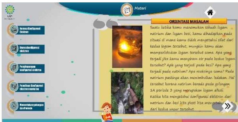
Figure 2. E-module display at the problem orientation stage

At this stage, each group is required to analyze the problems on the worksheet and the problems on the e-module. Students must understand the phenomenon of iron (Fe) and sodium (Na) when they react with water which is presented at the problem orientation stage. The problem orientation display on the worksheet and e-module can be seen in Figure 2 .