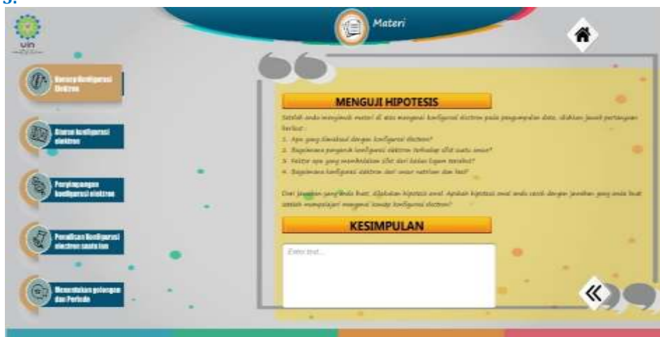
Figure 5. E-module display at testing a hypothesis stage

The next stage in the worksheet is the hypothesis testing stage. After collecting data obtained from the electronic configuration e-module. The e-module display at the hypothesis testing stage can be seen in Figure 5.