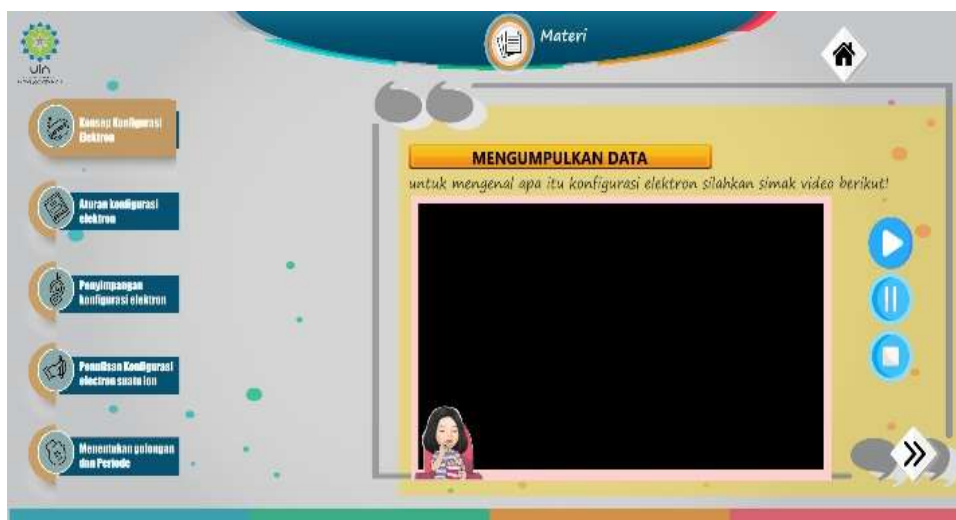
Figure 4. E-module display at data collection stage