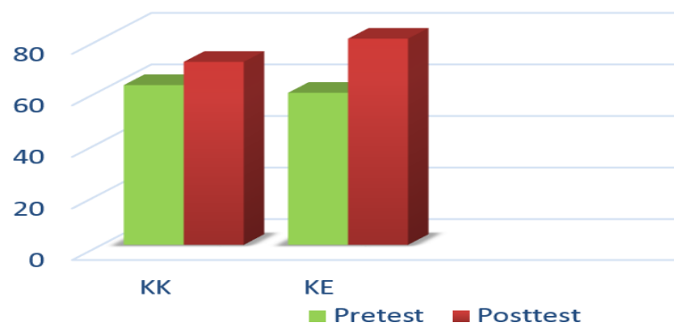
Figure 2. The Result of Science Process Skill Pretest-Posttest