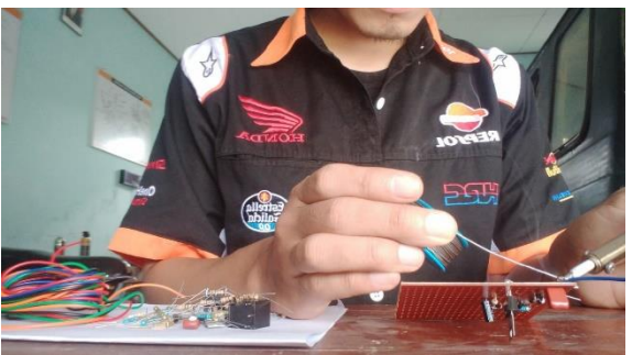
Figure 3. Example of Product 1