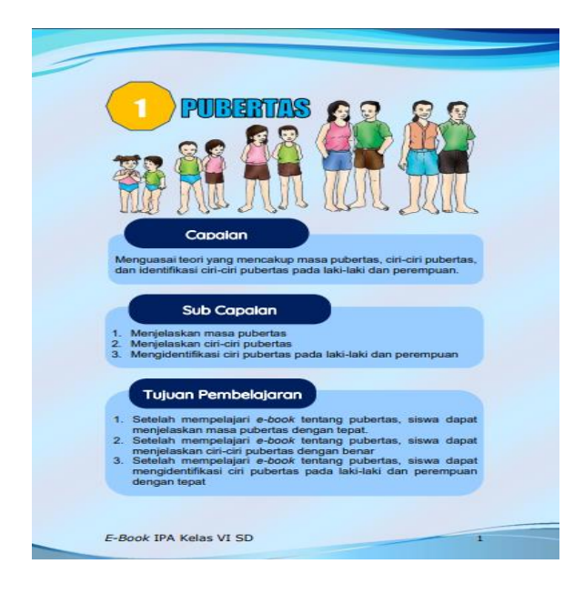
Figure 3. Competency Display

In the learning instructions display, users are given information about the learning instructions for this e-book teaching material, starting from the pictures of the menus to the functions of each navigation button in this e-book teaching material. User competency display page is show in Figure 3.