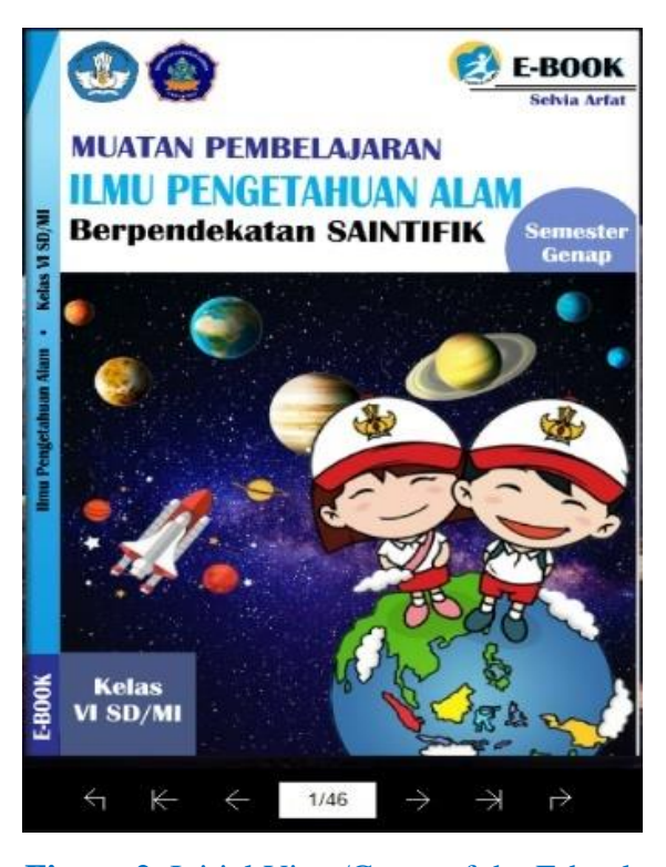
Figure 2. Initial View/Cover of the E-book

buttons, namely navigation buttons to open pages and sound buttons that can be turned off or on, and increase or decrease the volume. The cover of the e-book is shown in Figure 2.