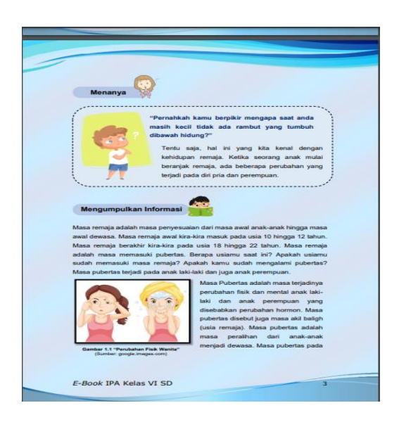
Figure 4. Display of Learning Materials

On the learning material display page, learning material is presented that can be listened to and studied by users. The preparation of material for this e-book teaching material is carried out by balancing the composition of text, images, animation and video while always paying attention to the principles of e-book design. Learning material display is show in Figure 4 .