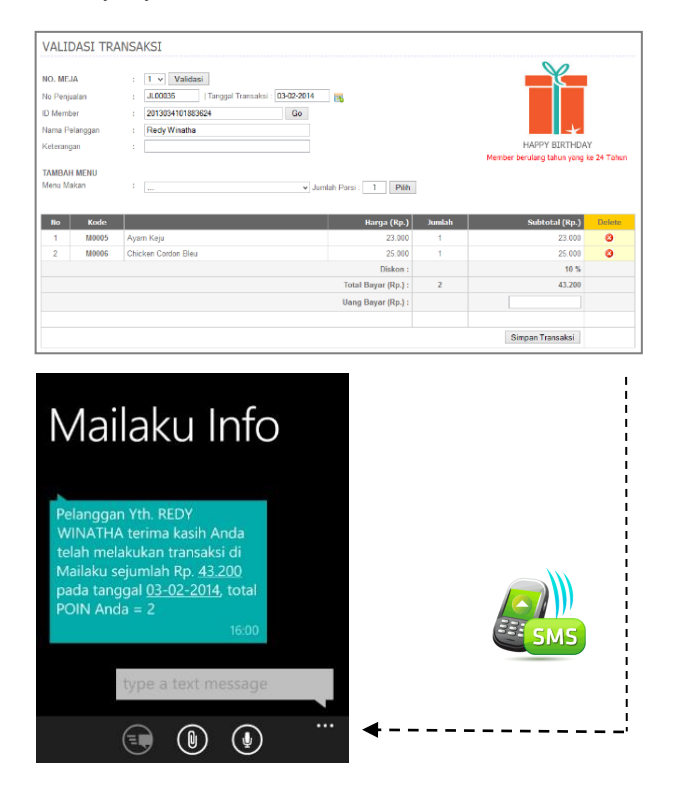
Figure 7. SMS to customers after a transaction

Figure 6 shows if there is a member's birthday, the system will automatically send a birthday greeting SMS. Saying birthday to customers, is a form of strategy to build relationships with customers[8]. With this strategy, customers will feel flattered for the attention given so they feel satisfied with service and build loyalty.