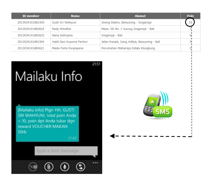
Figure 9. SMS of point redemption

In Figure 9, it explains if the member points are enough to exchange prizes, the system will send member points SMS that can be exchanged for prizes according to the number of points. This is a company strategy to maintain customers who have high loyalty.