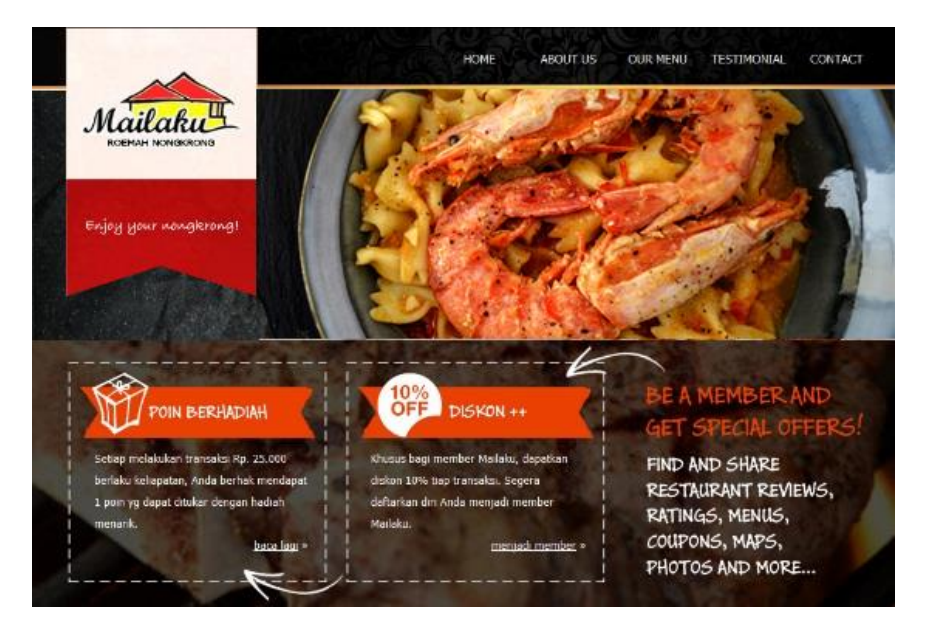
Figure 5. Display of visitor pages

Figure 4 is the start page of the user who accessing as a cashier. The initial appearance consisted of four parts, namely: main navigation in the form of processing buttons, profiles in the form of user information, agenda in the form of information on agenda that must be carried out by staff, and main content that contains sales notifications and graphs of monthly number of members. In this access right, there are several functions that can be performed by the user including new member registration, point exchange, place reservations, sales transactions, and data that the cashier needs to know such as promo data and gift data to be delivered to customers.