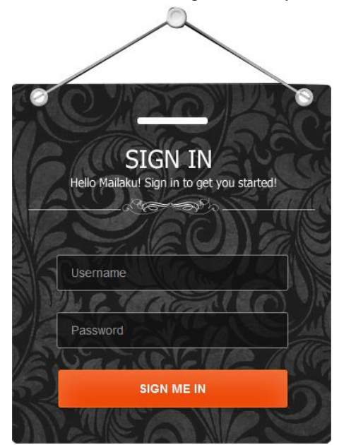
Figure 1. Sign in page

The next stage was design. This stage produced a visual display of the user interface of the system being built. System users were divided into 4 groups, such as admin, marketing, cashier, and customer. The following were some of the Operational CRM application views that were built. The initial view that will be seen by the user when entering into this system is shown in Figure 1.