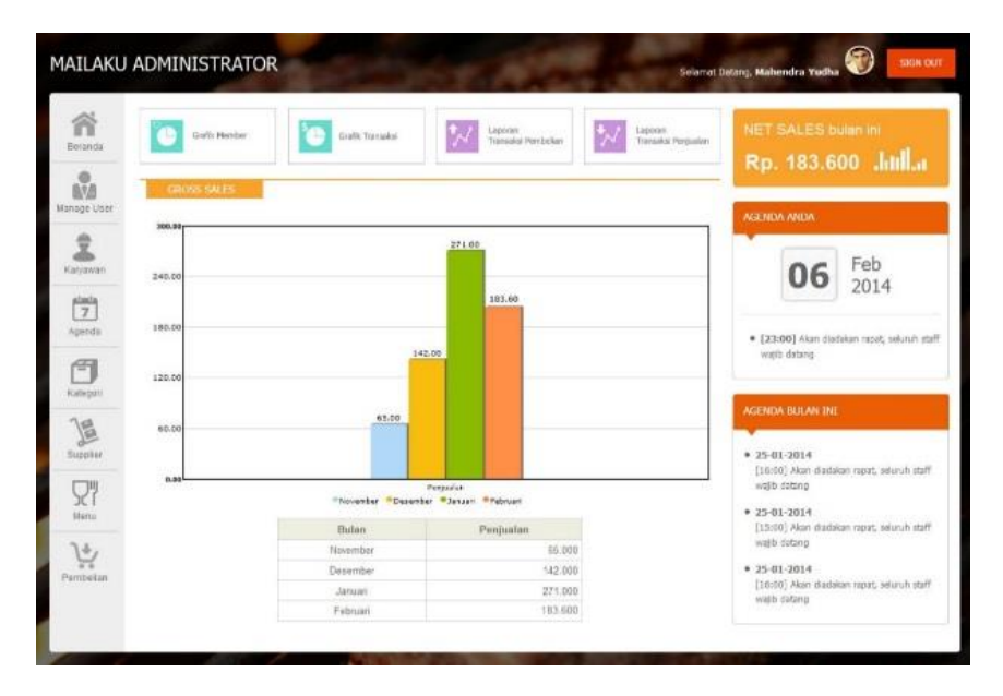
Figure 2. Page views of users who accessing as administrator

password have not been registered, then the user cannot enter the main menu and in this case, the user is expected to register first with the admin.