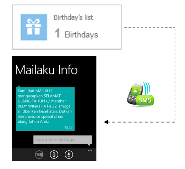
Figure 6. SMS Birthday

SMS gateway is a facility provided in a special CRM operational system for registered customers (members). Through the cashier, customer data that will become a member is inputted in the system. The data of custumers was such as the name, place and date of birth, address and telephone number. This data will be processed as supporting data to determine customer habits, and increase customer loyalty through promos.