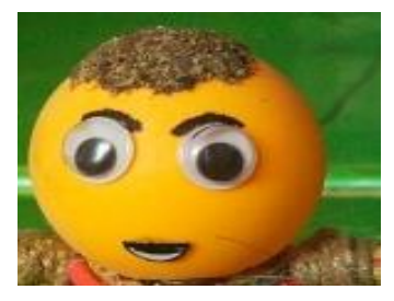
Figure 2. The Head of a Rather Stubborn Boy