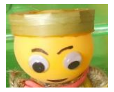
Figure 3. Kind Boy Head