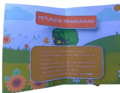
Figure 3. Media Usage Instructions Pop-Up Books