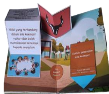
Figure 4. Media Contents Pop-Up Books

The media that has been developed is then tested for validity and practicality. The media validity test was carried out by 4 experts from material, media and learning design expert assessments. The assessment uses a questionnaire with a Likert scale range that has been modified with the provisions "Strongly Agree (SS) = 4"; "Agree (S) = 3"; "Disagree (TS) = 2"; "Strongly Disagree (STS) = 1". Testing the validity of the material was carried out by 2 expert lecturers who assessed the material, 2 media experts and 2 learning design experts. Validity testing was also carried out with individual trials involving 3 students and small group trials involving 9 students. The results of the validity test and practicality test can be seen a Table 2 .