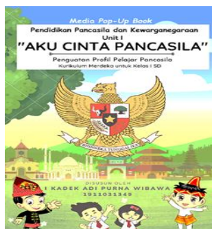
Figure 2. Pop-Up Book Media Cover

developed contains cover components, learning objectives, and content. The appearance of the cover, learning objectives, and contents can be seen at pictures 2, 3, and 4 .